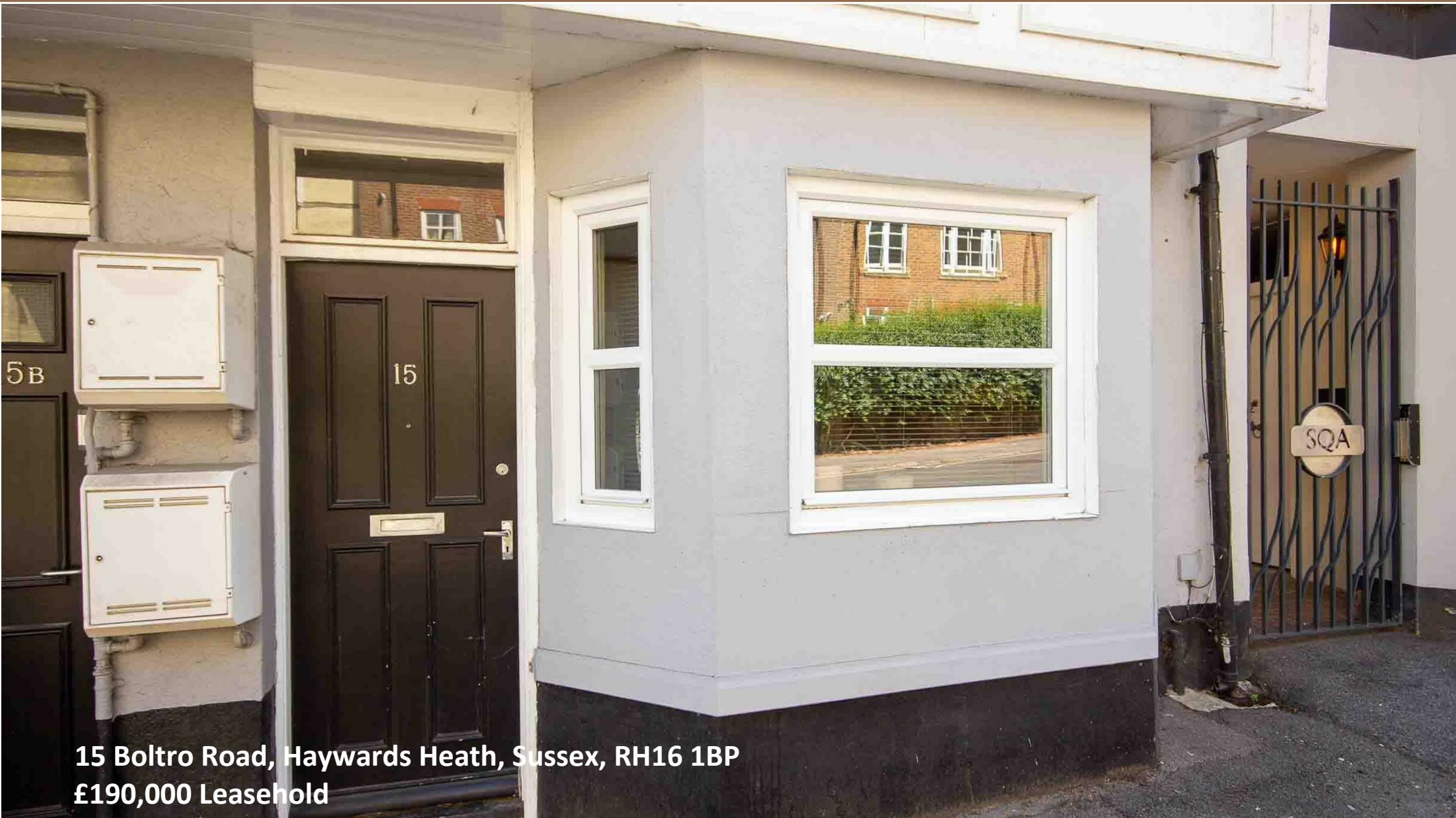
15 Boltro Road, Haywards Heath, Sussex, RH16 1BP £190,000 Leasehold